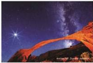
Arches NP, Durbin Zanker