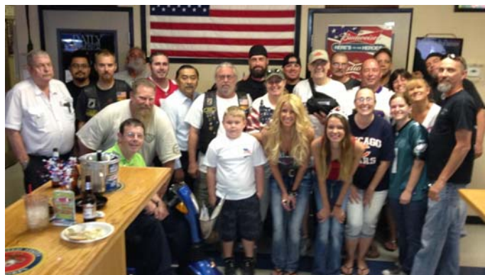
S.A.L. Breakfast at Post 91