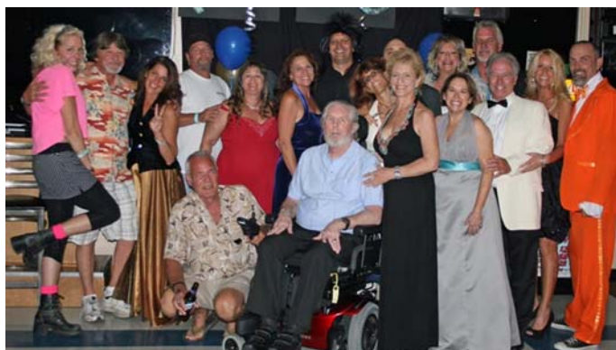
Prom Night 2013 at Post 91